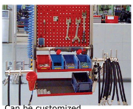
Can be customized